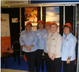
All dressed up and ready to go! Emigrate2 York 2007

Sharing our experiences with prospective migrants Emigrate2 Coventry 2007